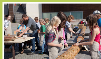
Forest in Education